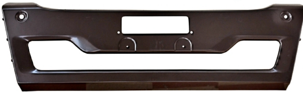
BB002 FRONT CENTER BUMPER ASSY.