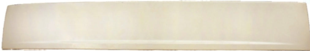
BB008 FRONT PANEL (FLAP) COVER ASSY. N/M