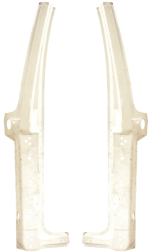
BB013 FRONT FULL OUTER PILLER