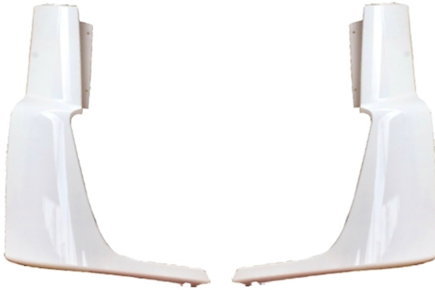
BB004 FRONT VAN CORNER N/M