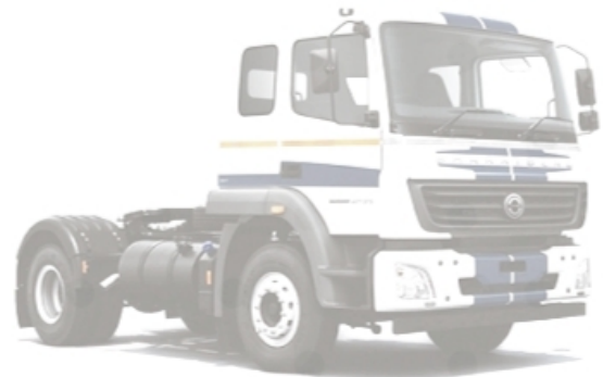
BB014 FRONT INNER LOWER PILLER