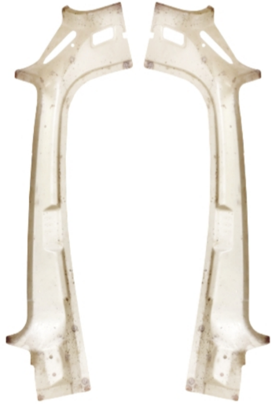
BB011 FRONT UPPER INNER PILLER