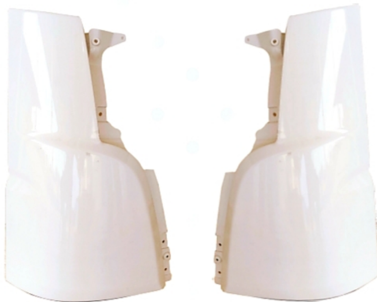
BB005 FRONT VAN CORNER O/M