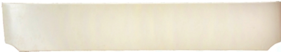
BB010 FRONT PANEL (FLAP) COVER ASSY. O/M