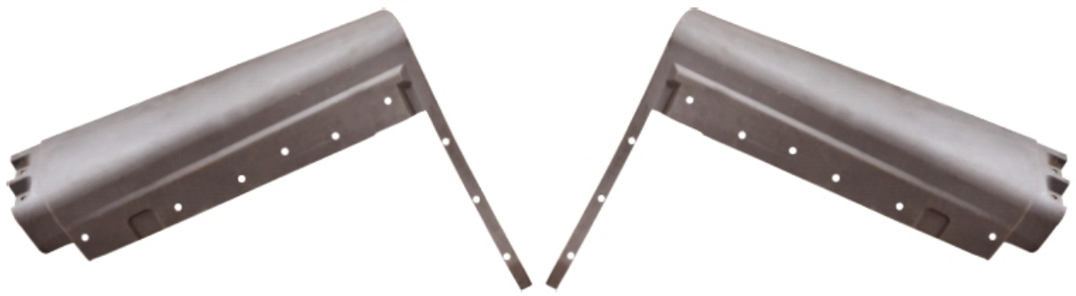
BB015 FENDER (VERLAENGERT)