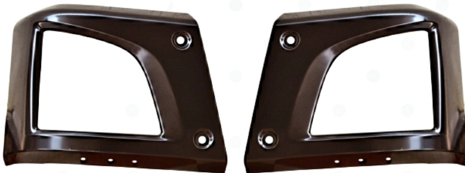
BB003 FRONT BUMPER CORNER ASSY.