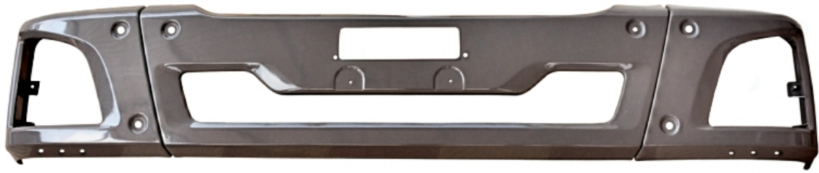
BB001 FRONT FULL BUMPER (SET OF 3 PCS)