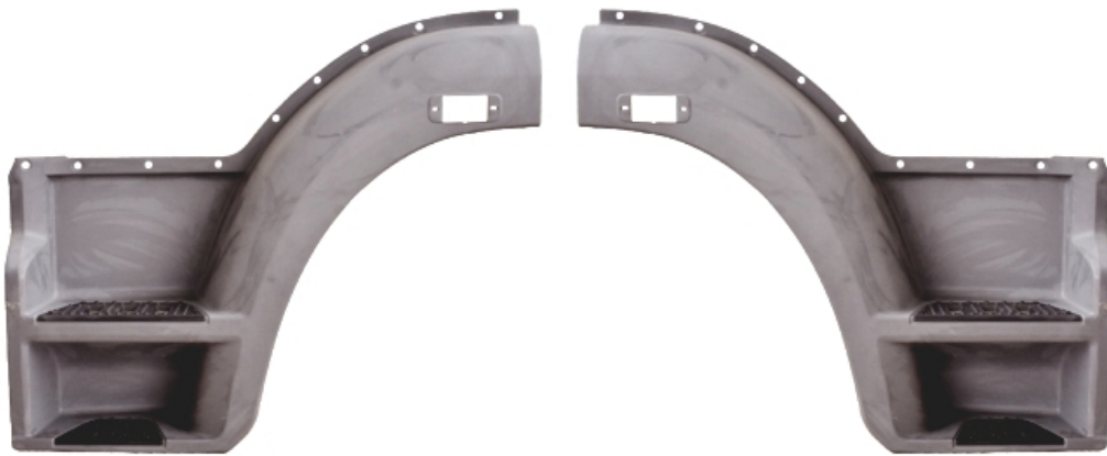
BB016 FRONT MURGA (ENTRANCE)